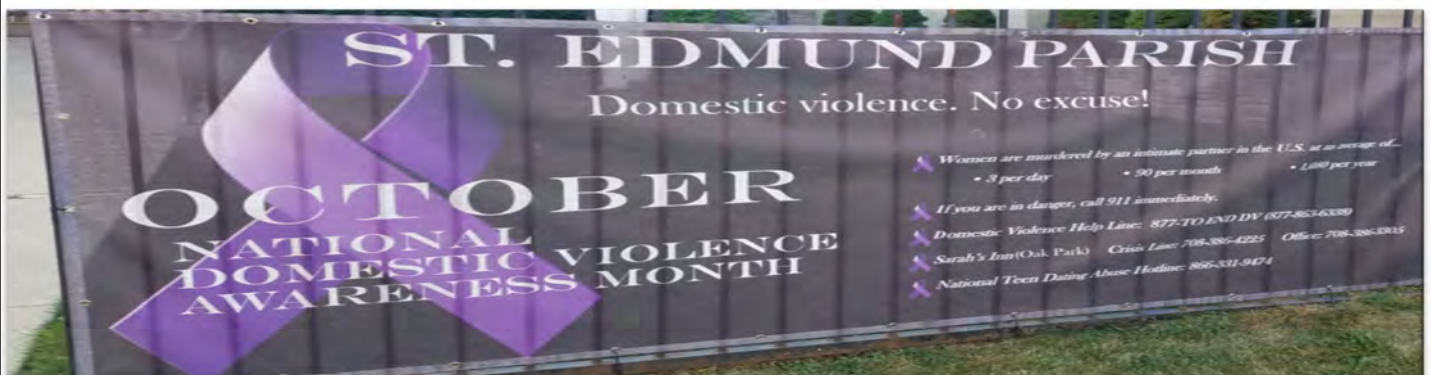
St. Edmund Parish Domestic Violence Awareness banner and purple ribbon display on Oak Park Avenue